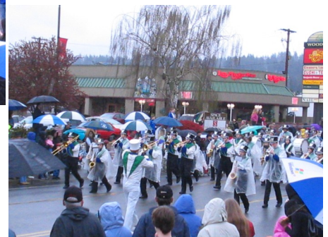
Woodinville High School Marching Band