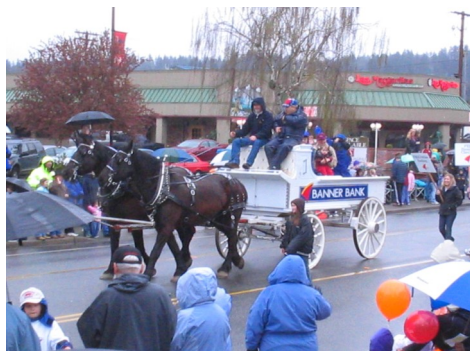
Banner Bank's 2006 entry

We're sure there is something for everyone on this day we Celebrate Woodinville!